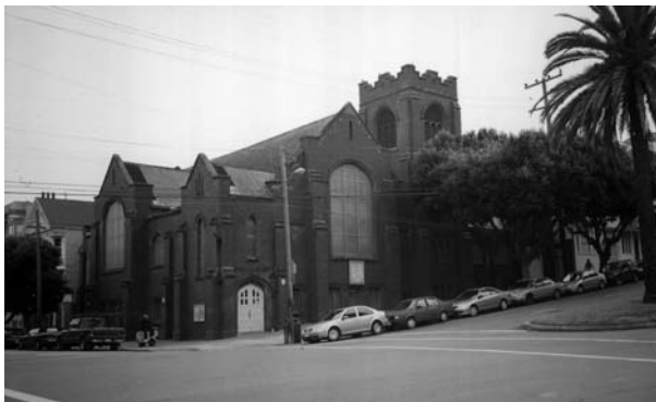
Golden Gate Lutheran Church

In recent weeks, the prospect of demolition for three churches that are home to other denominations has emerged. All are relatively small congregations with structures—in some cases too large for the present communities—requiring costly seismic upgrades.