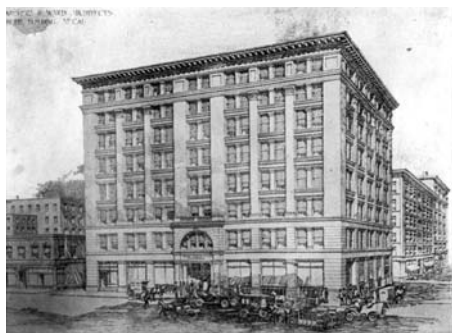
San Francisco: The Metropolis of the West (1910)

Percy & Hamilton designed the Wells Fargo Building (1898), at the northeast corner of Second and Mission, as offices for the express company. Originally six stories, the structure had “a steel skeleton, self-supporting walls, and reinforced floors,” as noted by the USGS, which summed up the damage as follows: “The building shows, especially in the Mission street front, the racking effect of the earthquake. The marble treads of the cast-iron stairways were considerably damaged by the fire, and the marble wainscoting of the corridors was thrown down by the earthquake. The [metal] window frames in the light well were warped by the fire, which also spalled the terra-cotta trim.”