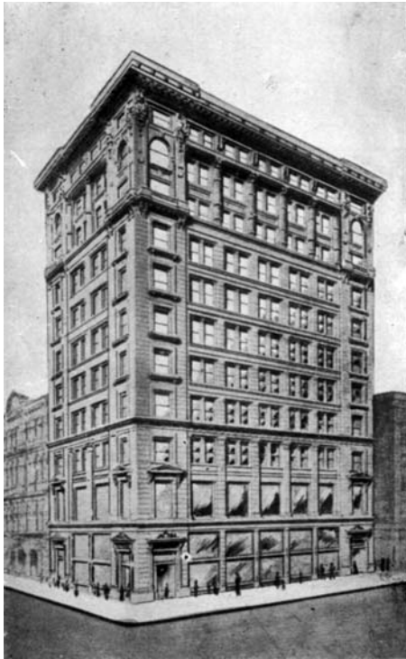
San Francisco: The Metropolis of the West (1910)

The eleven-story Shreve Building at the northwest corner of Post and Grant (William Curlett, architect, 1905), constructed on a fireproofed steel frame with reinforced concrete floors, performed well in the earthquake. Completed just prior to the temblor, it took its name from the jeweler, Shreve & Co., that moved into the ground floor retail space only a month before disaster struck.