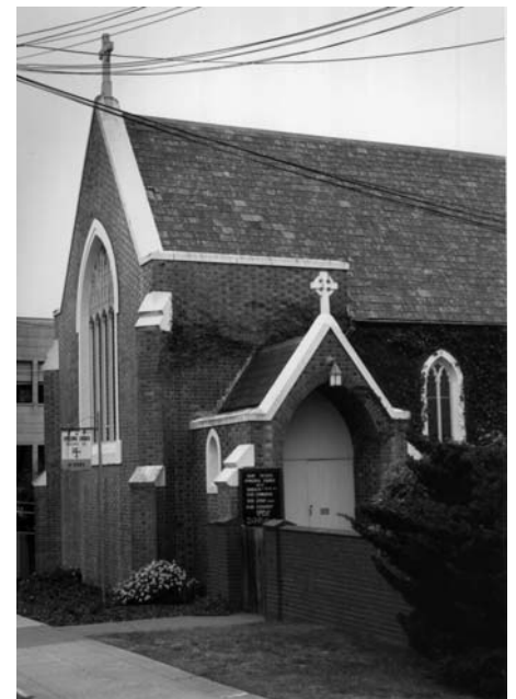
St. Peter's Episcopal Church

Initially, we were unable to get clarification of the parish's plans. Recently, however, word has gotten around that, in fact, the church is to be demolished. We expect some details on plans for the site soon, and will report further. The City's UMB historic resource survey designated St. Peter's Priority 1 for preservation.