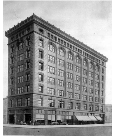
San Francisco: The Metropolis of the West (1910)

In a bit of forgivable over-reaction to the disaster, the owner quickly announced plans to complete construction, according to Splendid Survivors , by sheathing it in steel plates for added seismic and fire resistance. This initial proposal gave way to economics, practicality and—with the high demand for office space—the need to get the building on line as soon as possible. Steel shortages would have caused unacceptable delays.