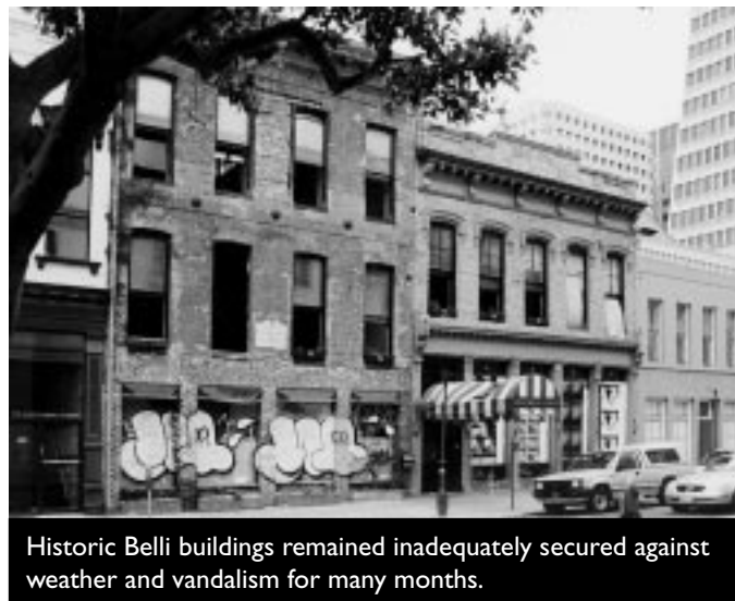
Historic Belli buildings remained inadequately secured against weather and vandalism for many months.

In spite of the fact that Heritage tried to work with the owner and with DBI to remedy this situation, the condition persisted. Finally, under an order from