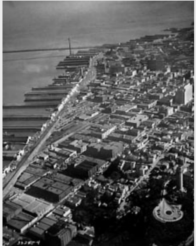
Many piers in this pre-1957 photograph of San Francisco’s waterfront no longer exist. In the interest of protecting what remains, the Port will seek listing on the National Register.