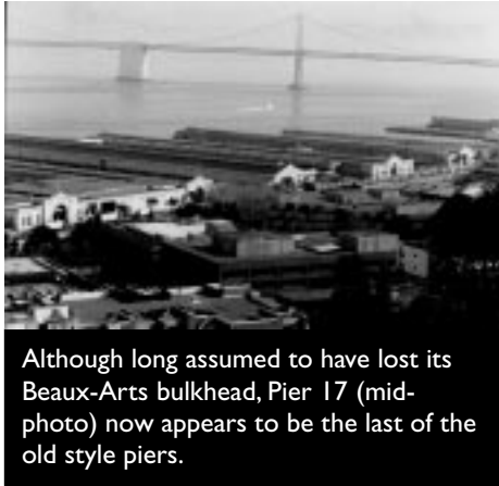
Although long assumed to have lost its Beaux-Arts bulkhead, Pier 17 (mid-photo) now appears to be the last of the old style piers.

Pier One's developer, thanks to the National Register listing, is able to take advantage of rehabilitation tax credits for a project, now in construction, that will meet the Secretary of the Interior's Standards. Benefits accrue all around: a financial incentive for the developer, an