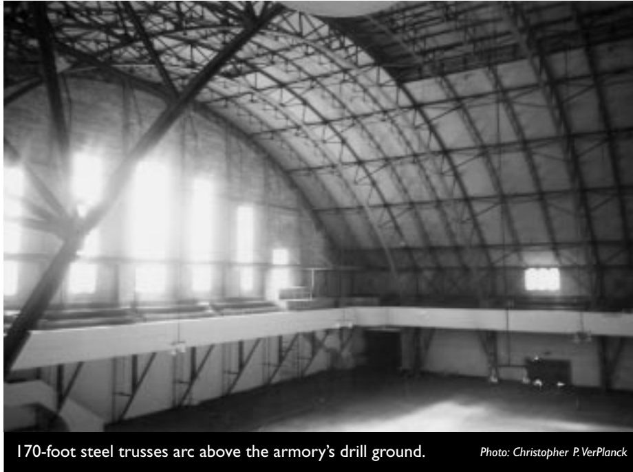
170-foot steel trusses arc above the armory's drill ground.

intersection at Mission and 16th Street. Woollett defended his design and blamed any deficiencies it may have on the relatively low budget allotted to the project. The meeting concluded with