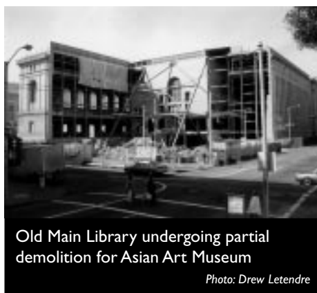
Old Main Library undergoing partial demolition for Asian Art Museum

These signs did not point to a successful outcome for our suit against