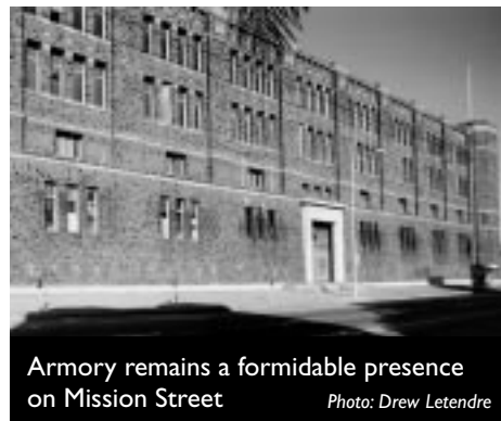
Armory remains a formidable presence on Mission Street

The new San Francisco Armory was to house ten companies of the Coastal Artillery, two divisions of the Naval Militia, one Signal Corps, one Engineering Corps and several other divisions of the California National Guard brought