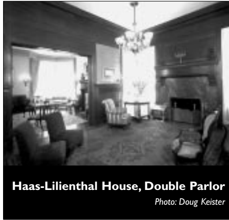
Haas-Lilienthal House, Double Parlor