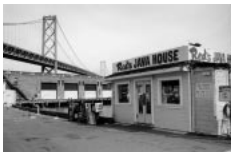
Historic research will determine if buildings like Red's Java House and Boondocks (both pre-1936) and Pier 23 Cafe contribute to district.

We believe the goal of increased public access is attainable by such means as opening the aprons around the perimeter of the pier sheds to the general public or through removal of non-historic structures along the water's edge. On March 17, a joint Port/BCDC design charrette coordinated by SPUR, the Northeast Waterfront Advisory Committee and a group of interested citizens, including Heritage, proposed alternatives to meet public access goals, specifically at Piers 27 through 31. The result of that effort has been to increase awareness that removal of historic resources does not make sense, because they are a major reason the public—locals and tourists—as well as developers, are drawn to the waterfront.