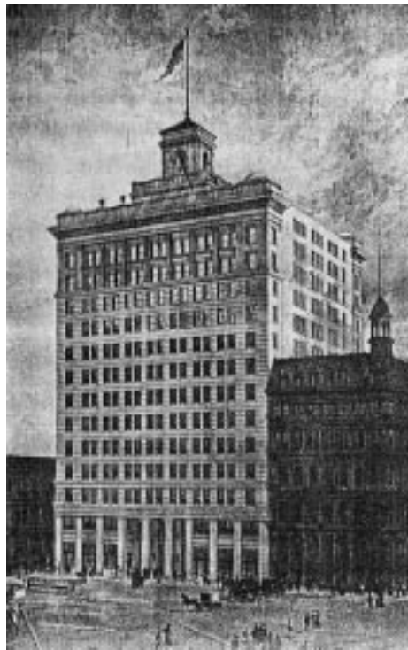
The Architect and Engineer, April 1911

Architecturally the building represented the most up-to-date stylistic treatment from one of Chicago's most important architectural firms. Its design has served as one of the major prototypes for later downtown office buildings from the immediate post-fire period up to the mid-1920s. The Matson, California Commercial Union, Financial Center, J. Harold Dollar, Hobart and P.G.&E. buildings are among the most prominent whose designs follow the Merchants Exchange in one or more ways. It was the first San Francisco building to use a large textured curtain wall treated as rusticated masonry with single or paired windows. This distinctive wall treatment, which was used over and over