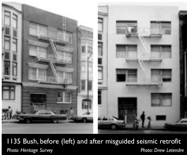
1135 Bush, before (left) and after misguided seismic retrofit

Clearly, from the example of the photographs included here, this retrofit did not comply. When the director of planning reported back to the commission two weeks after learning of this case, he announced that the Department of Building Inspection issued a permit for this work "by mistake."