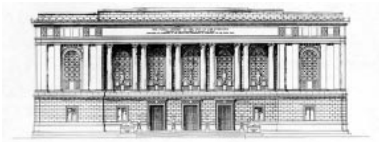
Perception that Heritage failed to communicate on Old Main Library drew members' criticism.

Some criticism from the members assembled had the flavor of "Monday-