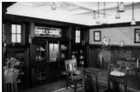
Workshop will illustrate historically appropriate rehabs with examples like this one.

The program begins with a visual overview of residential architectural styles from Victorian to '50s and '60s Modern, and moves on to illustrate, with examples of successfully completed projects, the most appropriate way to rehabilitate houses that exemplify the various styles. Participants will have the opportunity for an informal consultation with the panelists, particularly regarding any “odd” room or architectural detail in their homes that they have been trying to decipher. Finally, the workshop will explain how to take advantage of Mills Act Historic Property Tax Reduction programs.