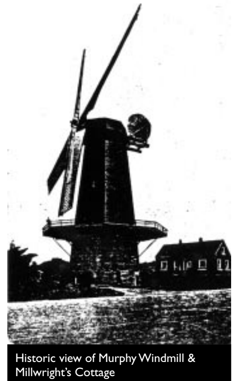
Historic view of Murphy Windmill & Millwright's Cottage