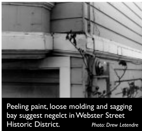
Peeling paint, loose molding and sagging bay suggest neglect in Webster Street Historic District.

The catalyst to formation of the district was the replacement of a bungalow at 2232 Webster with a five-