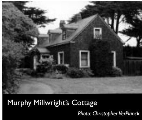
Murphy Millwright's Cottage