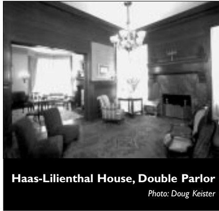
Haas-Lilienthal House, Double Parlor