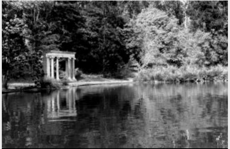
Poignant symbol of San Francisco's history and architecture, the "Portals of the Past," in Golden Gate Park.