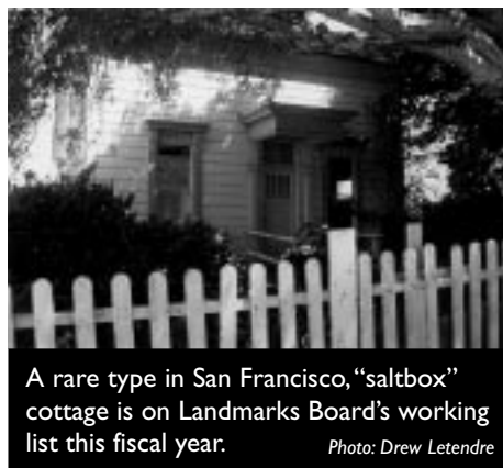
A rare type in San Francisco, "saltbox" cottage is on Landmarks Board's working list this fiscal year.

In July, when the Landmarks Board began to formulate its work program for the 2000-2001 fiscal year by considering a long list of landmark candidates, this broader participation was evident. The discussion drew much public comment from individuals and representatives of groups and interests that included