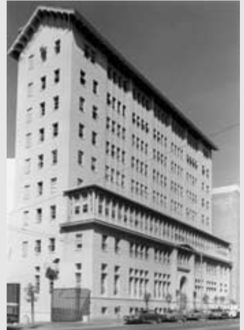
Juvenile Court and Detention Home, 150 Otis Street (Mullgardt, 1914)

Continuous pilasters and window mullions that become brackets at the eaves extend from the 4th through 9th floors, giving the building a strong vertical emphasis. A wide-overhanging gabled roof clad in Spanish tile tops the structure. Such features have prompted