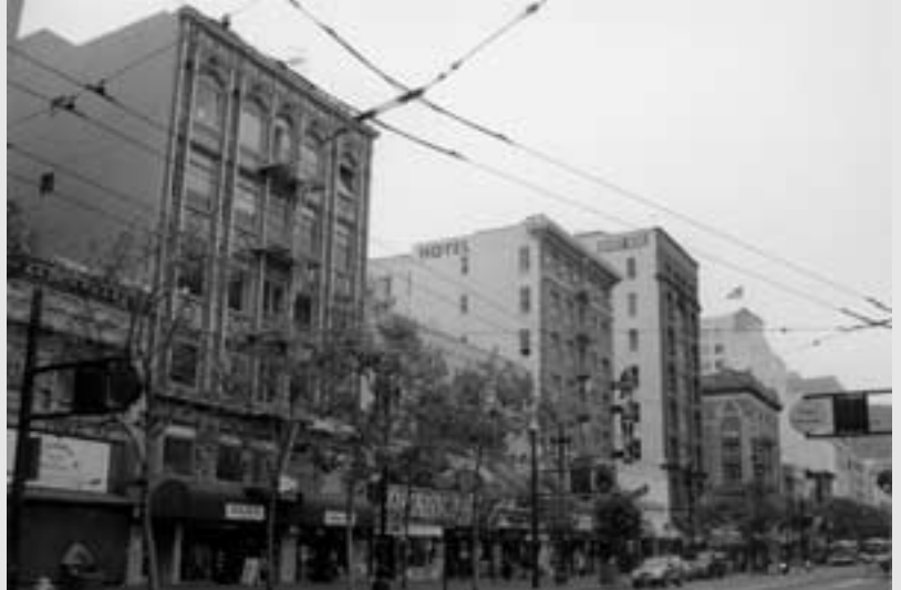
South side of Market looking beyond 7th Street, included in Mid-Market Redevelopment Plan.

Related to preservation, the Mid-Market Plan would include rehabilitation of landmarks and theaters, facilitated by a theater rehabilitation loan program, and a façade improvement program. In a preliminary review of the district, Heritage determined that the project area includes several designated resources, including the Market Street Theatre & Loft National Register District, the southeast edge of the City’s Civic Center Historic District, and the southwest corner of the Kearny-Market-Mason-Sutter Conservation District,