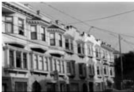
Row of flats on Ramona Street will be included in reconnaissance survey of the North Mission District.

The Landmarks Preservation Advisory Board and the Planning Commis-