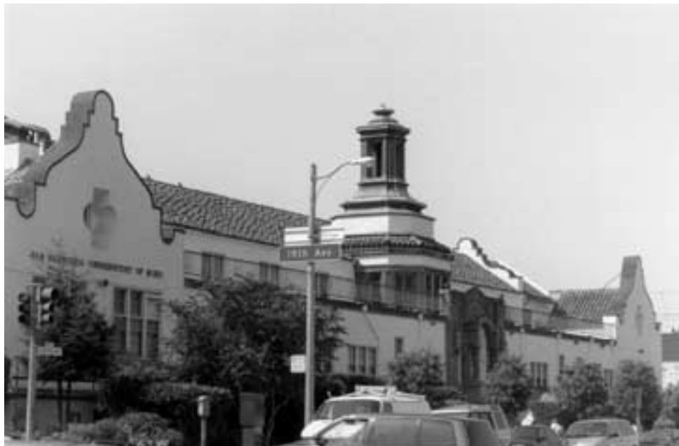
San Francisco Infant Shelter (now San Francisco Conservatory of Music), 19th Avenue and Ortega Street. (Mullgardt, 1927)