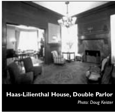
Haas-Lilienthal House, Double Parlor

The historic Haas-Lilienthal House, a property of San Francisco Architectural Heritage, is available for private or corporate events. The House can accommodate up to 150 guests. For information call (415) 441-3011.