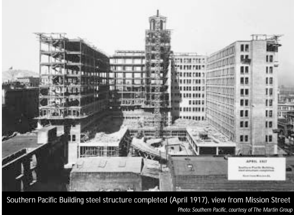
Southern Pacific Building steel structure completed (April 1917), view from Mission Street

These new shafts increase the structure's rigidity and receive the load of concrete reinforcement installed in the tower. The seismic upgrade had a side benefit; extending the floors at each level of the building into the new