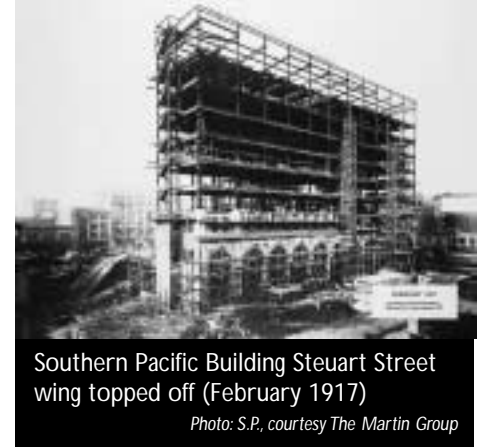
Southern Pacific Building Stewart Street wing topped off (February 1917)

The addition of shear walls to the southern ends of the wings increases their resistance to lateral forces, and the introduction of new steel beams within