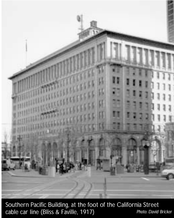
Southern Pacific Building, at the foot of the California Street cable car line (Bliss & Faville, 1917)

Southern Pacific claimed its new home was one of the largest office buildings west of Chicago. Rising ten