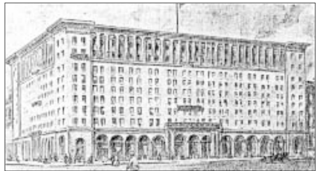
Polk's drawing from memory

Well, clearly not "exact," but close. In fact, Polk's own aesthetic may have informed his memory, noticeably in the fenestration, the treatment of the cornice and the rather more prominent corner bays.