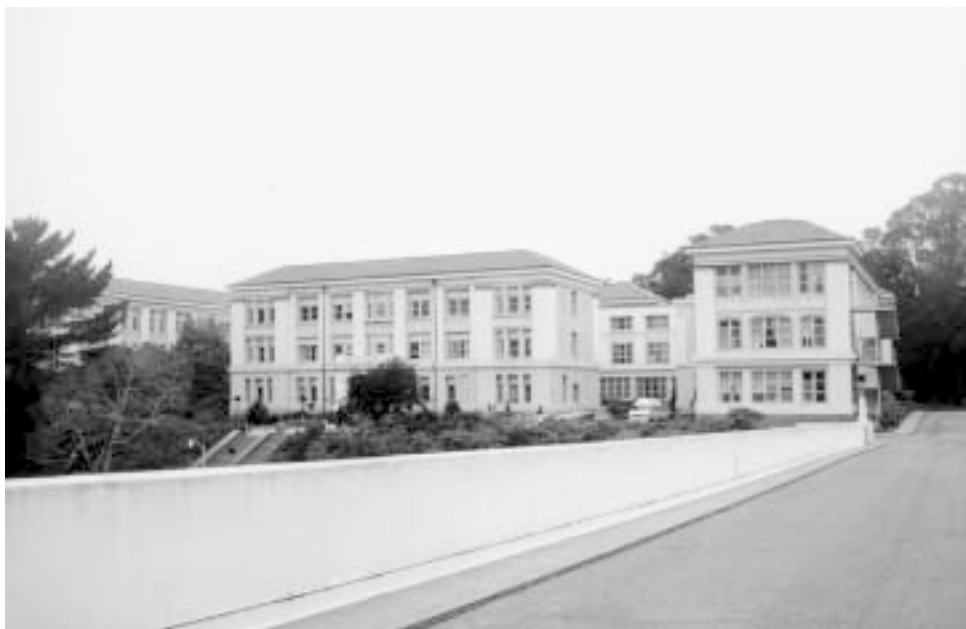
Clarendon Hall (Newton J. Tharp, 1908), oldest extant building at Laguna Honda, slated for demolition

The campus retains a certain bucolic character that recalls the early days of