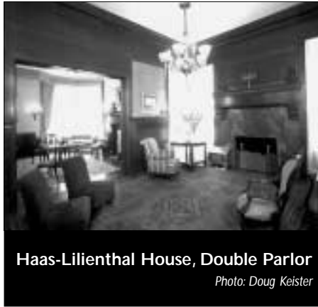
Haas-Lilienthal House, Double Parlor

The historic Haas-Lilienthal House, a property of San Francisco Architectural Heritage, is available for private or corporate events. The House can accommodate up to 150 guests. For information call (415) 441-3011.