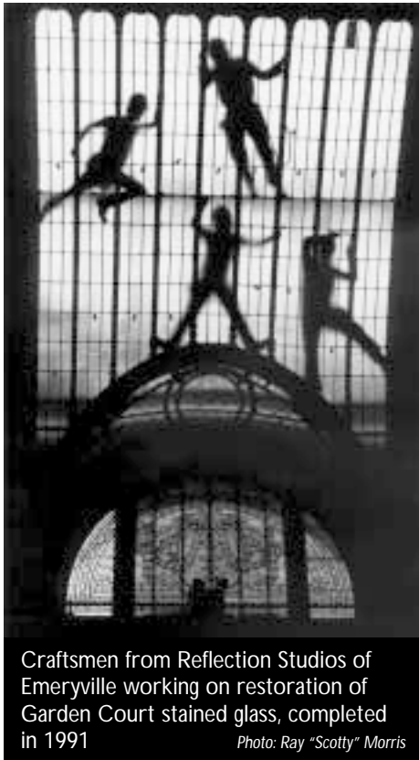
Craftsmen from Reflection Studios of Emeryville working on restoration of Garden Court stained glass, completed in 1991