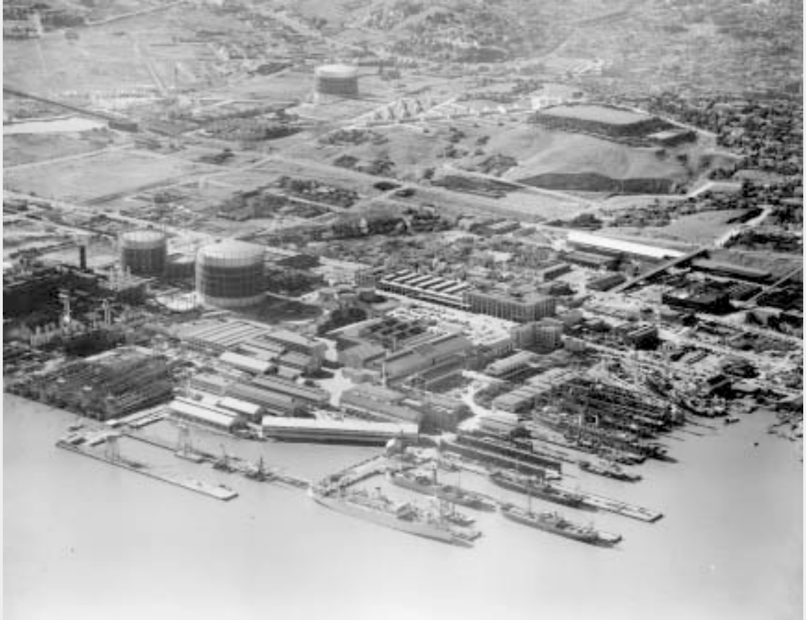
Aerial photograph (1945) shows heart of Central Waterfront survey area. Dogpatch is the enclave of small residential development behind large factory in center of image.