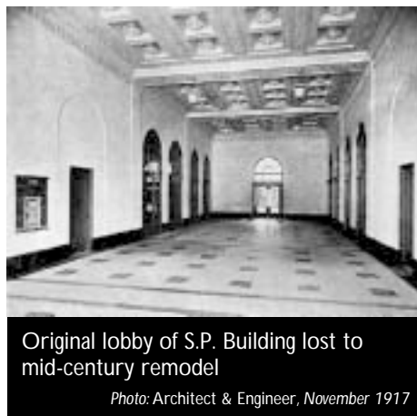
Original lobby of S.P. Building lost to mid-century remodel

A projecting tower housing elevators and lobbies for each floor extended a