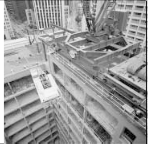
Hoisting platform (left) for one of two roof-mounted cranes, shown in place on right lowering drill rig into lightwell for installation of new piles in recently completed seismic retrofit of the Southern Pacific Building.