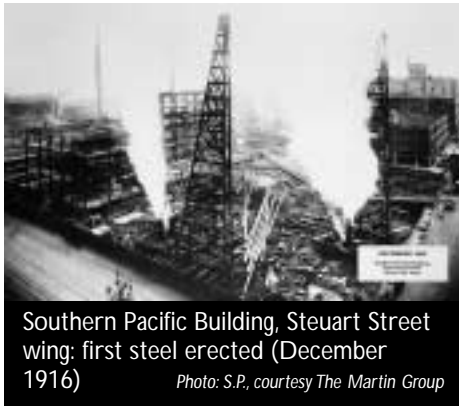
Southern Pacific Building, Stewart Street wing: first steel erected (December 1916)

govern design of the offices themselves. Finishes were mostly unexceptional. Large open-plan spaces that accommodated legions of clerks and bookkeepers filled upper floors in the building's two wings. A partition system allowed for reconfiguration of these spaces, as necessary.