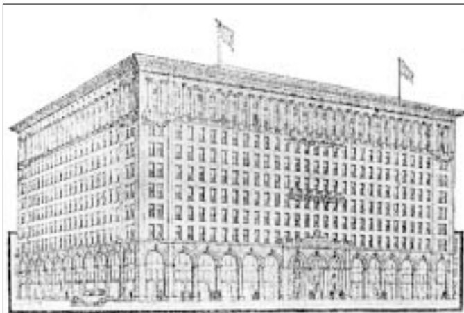
Southern Pacific Building, Bliss & Faville