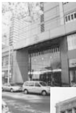
Modern tower (left) replaced historic building at 353 Sacramento (below).