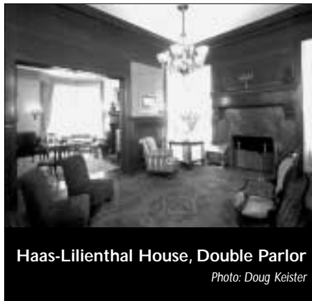
Haas-Lilienthal House, Double Parlor