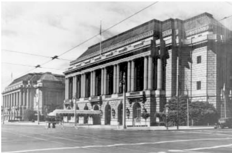
Historic view of Veterans Building (right) with Opera House.

Currently, most of the floor space houses administrative offices for the many veterans' groups that were party to the original War Memorial trust agreement under which the Opera House and the Veterans Building were built, as well as for the War Memorial Board. Relocating offices from the first floor to the second and third floors would allow developing uses that invite much more lively public participation.