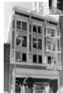
The Steil Building (left) was one of 4 buildings replaced by 101 Montgomery (above).

Photos: Historic buildings, as they appear in Splendid Survivors . Current photos by Katherine Petrin, of Architectural Resources Group