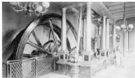
Equipment in the Engine Room (1882) no longer present, but some original gasoliers remain in the Old Mint.

Nationally significant for its role in government and economics, the Old Mint was pivotal in the financial history of the United States during a 63-year period, from 1874 until 1937. The second San Francisco Mint opened, not as a subsidiary to the Philadelphia Mint as originally planned, but, rather, independent of it, and soon became the most productive mint in the nation. By 1877, three years after its inauguration, it struck about $50 million of the total $83.9 million in gold and silver coins the United States produced that year. As a repository, the San Francisco Mint