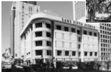
Saks Fifth Avenue (below) replaced historic Fitzhugh Building (right).