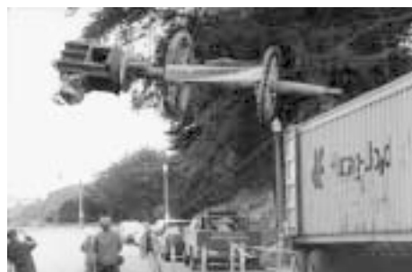
Guiding windmill mechanism into container for shipment to the Netherlands.