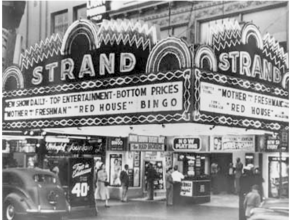
Strand Theater, 1127 Market St., c. 1949