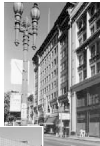
City of Paris (left) and Whitney Building (above) were demolished for Neiman Marcus (center).