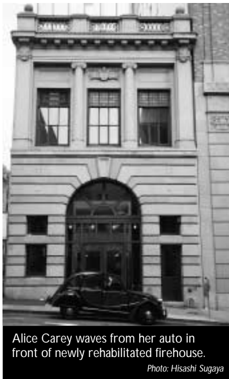
Alice Carey waves from her auto in front of newly rehabilitated firehouse.

Alice Carey purchased the old fire station in 1999 to house her preservation architecture practice. Committed to a model preservation project, she was determined to make it a case study in the application of economic incentives for preservation, as well, including federal rehabilitation tax credits and the Mills Act (see page one story). To meet the requirements of both, she crafted a plan that would comply with the