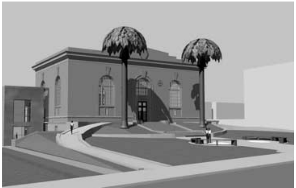
Schematic design for wing additions and accessible ramps at 9th Avenue entrance to Richmond branch

Initiating this program, Stoner Meek Architecture & Urban Design conducted a four-day design workshop at the Richmond Branch, June 6-9, to learn the community's views of the proposed rehabilitation and 4,000 square-foot