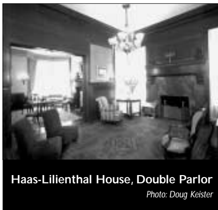
Haas-Lilienthal House, Double Parlor