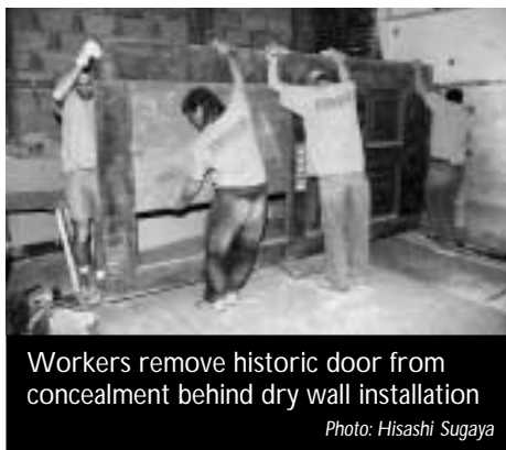
Workers remove historic door from concealment behind dry wall installation

Carey discovered that the 1982 alterations had encased—behind dropped ceilings and furred out walls—rather than removed historic features, including wainscoting, window openings, and scars from original partition walls and the hay loft. Joist pockets revealed the position of the latter. The floor plate of the newly installed mezzanine lies just below the scar line,