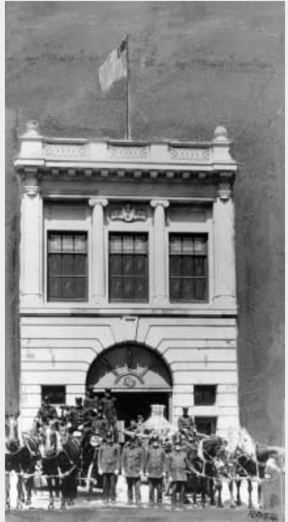
460 Bush Street, Engine Company No. 2 (c. 1910)

The term of a Mills Act contract is a minimum of 10 years, which term is automatically extended one year on the anniversary date of the agreement. Unless the owner files a notice of nonrenewal, it remains in force under all successive owners. The contract provides for periodic inspection by the appropriate city or state authorities to ensure the property owner's compliance. The Board of Supervisors may cancel the contract on evidence of noncompliance, and the Mills Act provides for a substantial penalty in that case.