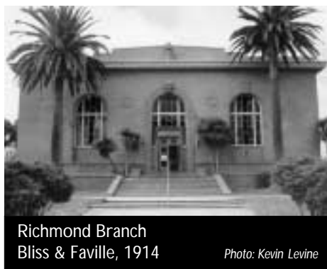
Richmond Branch Bliss & Faville, 1914