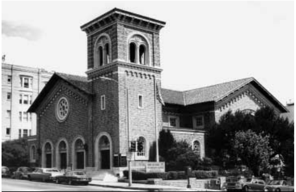
First Church of Christ, Scientist, Franklin & California (1980)

It appears to retain a very high degree of integrity. Its patterned brickwork still appeals to the eye, as it did in 1913, for its "exquisite blending of the tones and colors. . .varying shades of warm gray, yellow, golden brown. . .with. . .here and there. . .a red