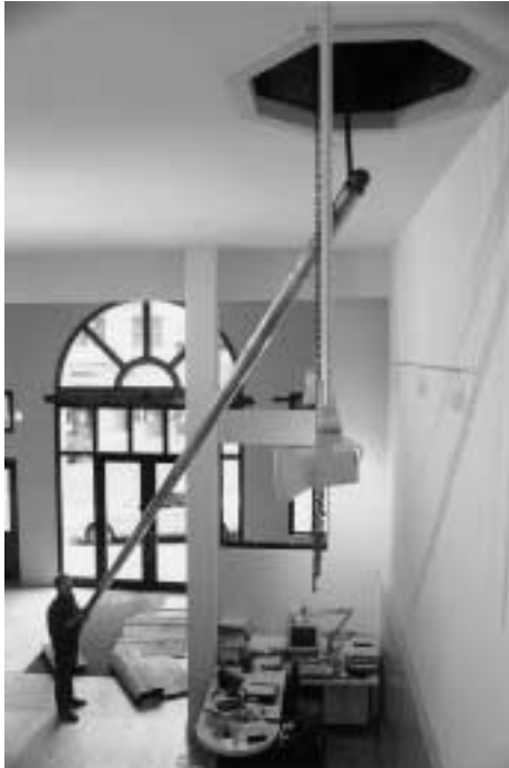
Raising fireman's pole into position at old Engine Company #2

large entry doors and the flanking cast metal light sconces were no longer in place. There had been some replacement of glazing, in the copper-clad lunette over the doorway.