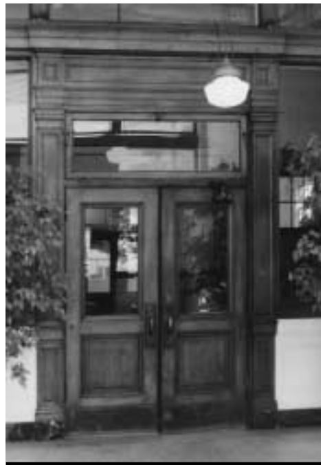
Pier 1-1/2, interior detail

The large arched entry in the Pier 3 bulkhead building would continue to admit pedestrian and vehicular traffic. The original ground floor spaces, which were mostly for storage, will undergo alterations for tenant use that include