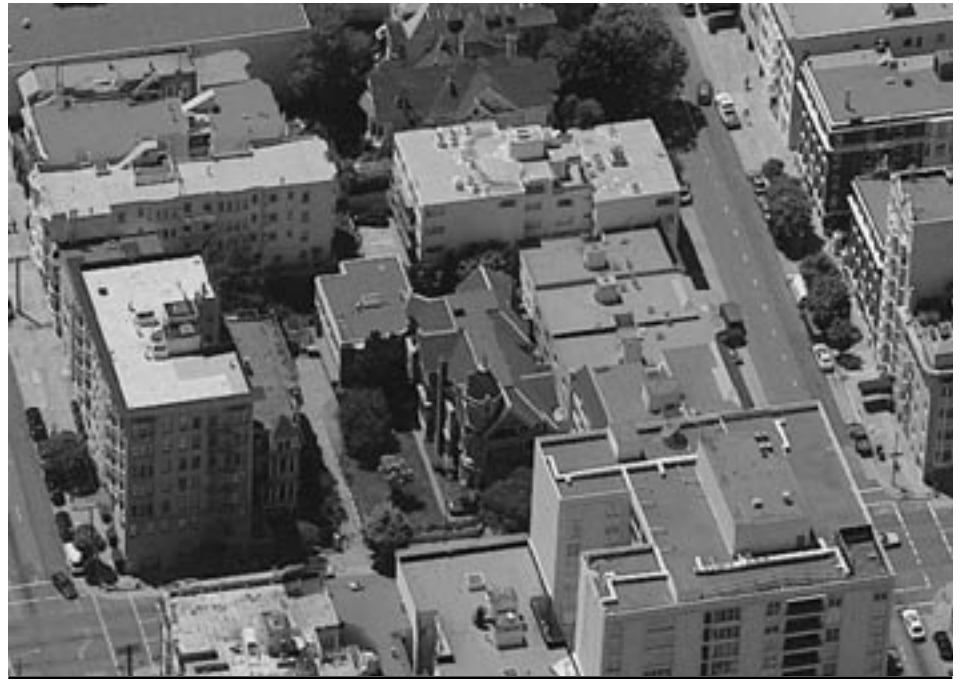
Oblique angle views of the Haas-Lilienthal House, front (above) and rear (next page), illustrate new technology at the disposal of San Francisco's Planning Department