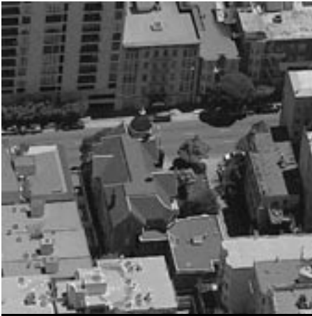
This shot offers the opportunity to appreciate the many planes and angles of the roof at the Haas-Lilienthal House.

require a visit to the property can now be done from the office. Planners can also easily answer such questions as “How many four-story buildings are in the surrounding blocks?” or “Would a proposed addition create a negative impact on a neighboring property.” Pictometry can help to determine whether an alteration would be visible from the street. In the near future, the department will be able to use the program to assist the public at the planning information counter.