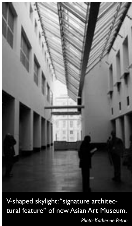
V-shaped skylight: "signature architectural feature" of new Asian Art Museum.

Cleaning and repair of the plaster ornamentation and other historic finishes inside the main entrance have paid off in a lighter and more welcoming experience. The grand stair on axis with the entrance draws the eye beyond the foyer, but an admissions desk presents a visual—and physical—barrier that somewhat undercuts the effect.