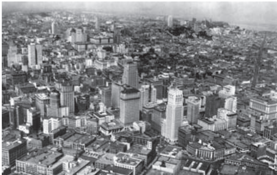
Photo: Financial District, 1931.

In these cases, we send a letter to the owner inviting a meeting to discuss alternatives to demolition. Frankly, very few of these contacts prompt even an acknowledgement, and since these are usually not rated