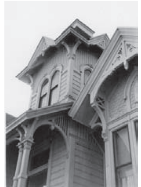
Heritage easement 201 Buchanan St.

Heritage accepted its first preservation easement donation in 1973, and today we hold easements on 56 buildings throughout the city. An easement is a legal instrument by which the owner of a property conveys a right in that property to another party.