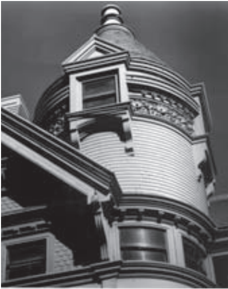
Haas-Lilienthal House

—In the more than 30 years Heritage has held the property, the Haas-Lilienthal House has been both a great resource for the organization and a great responsibility.